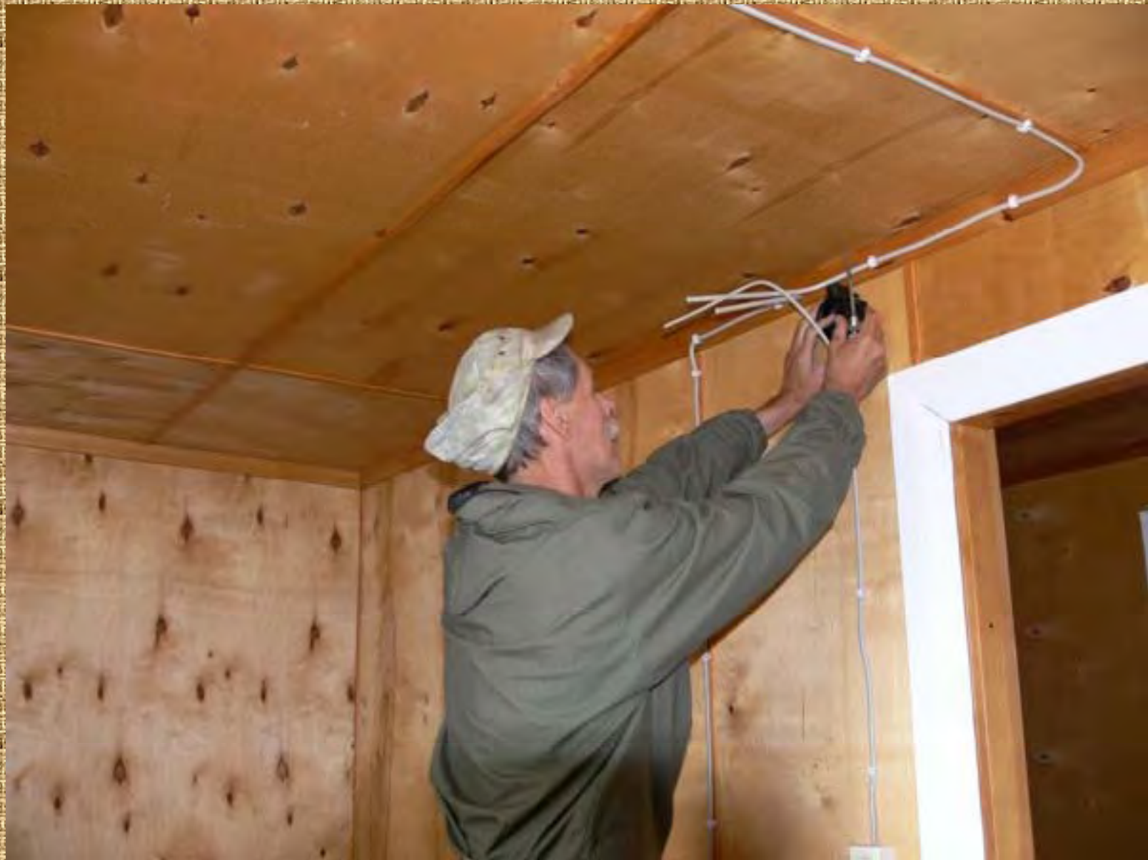
Electrical wiring in a guest house on the ornithological station "Gumbaritsy" is made by volunteer.