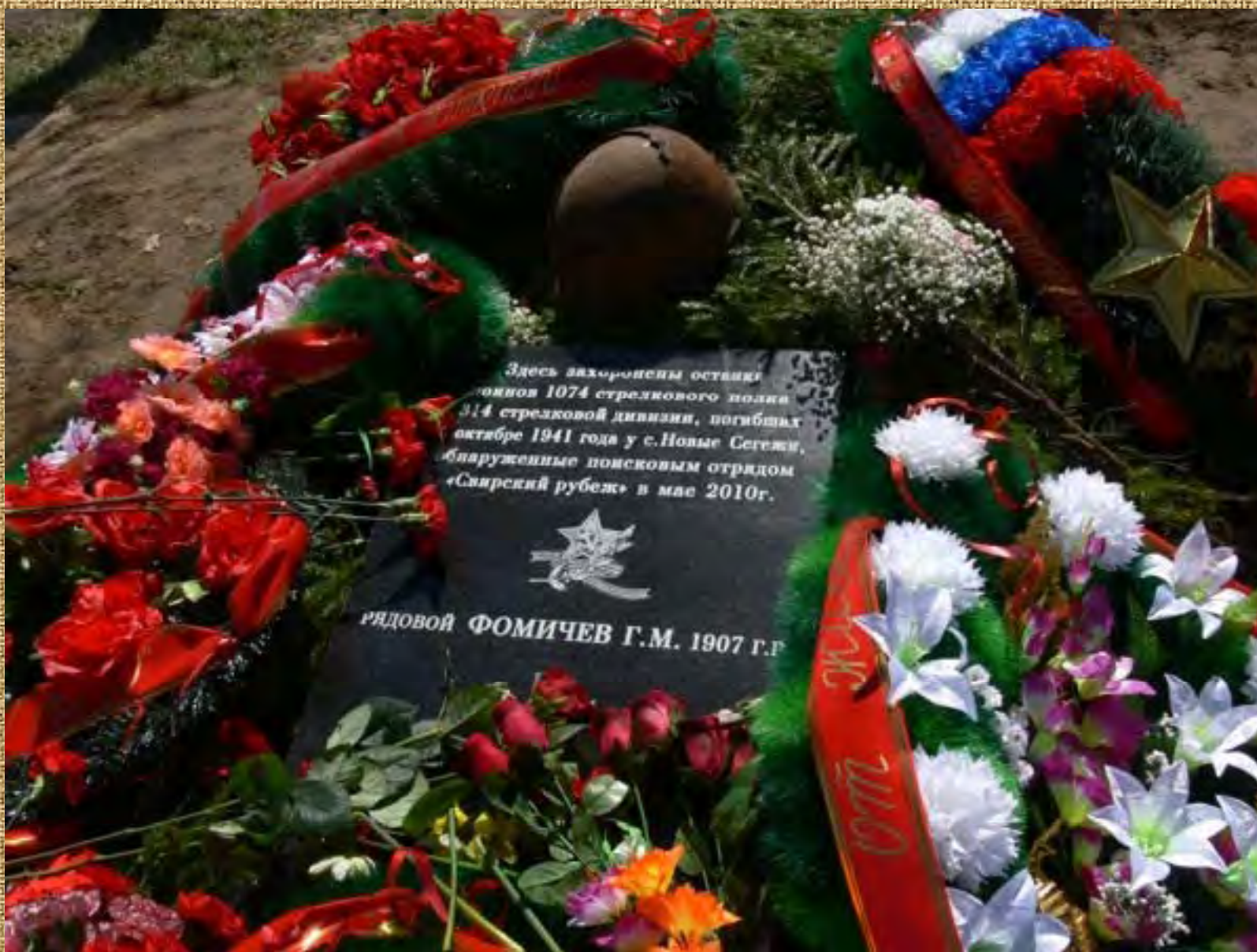
Burial of the soldiers remains of the 2nd World War, found by the members of the search group in the Reserve.