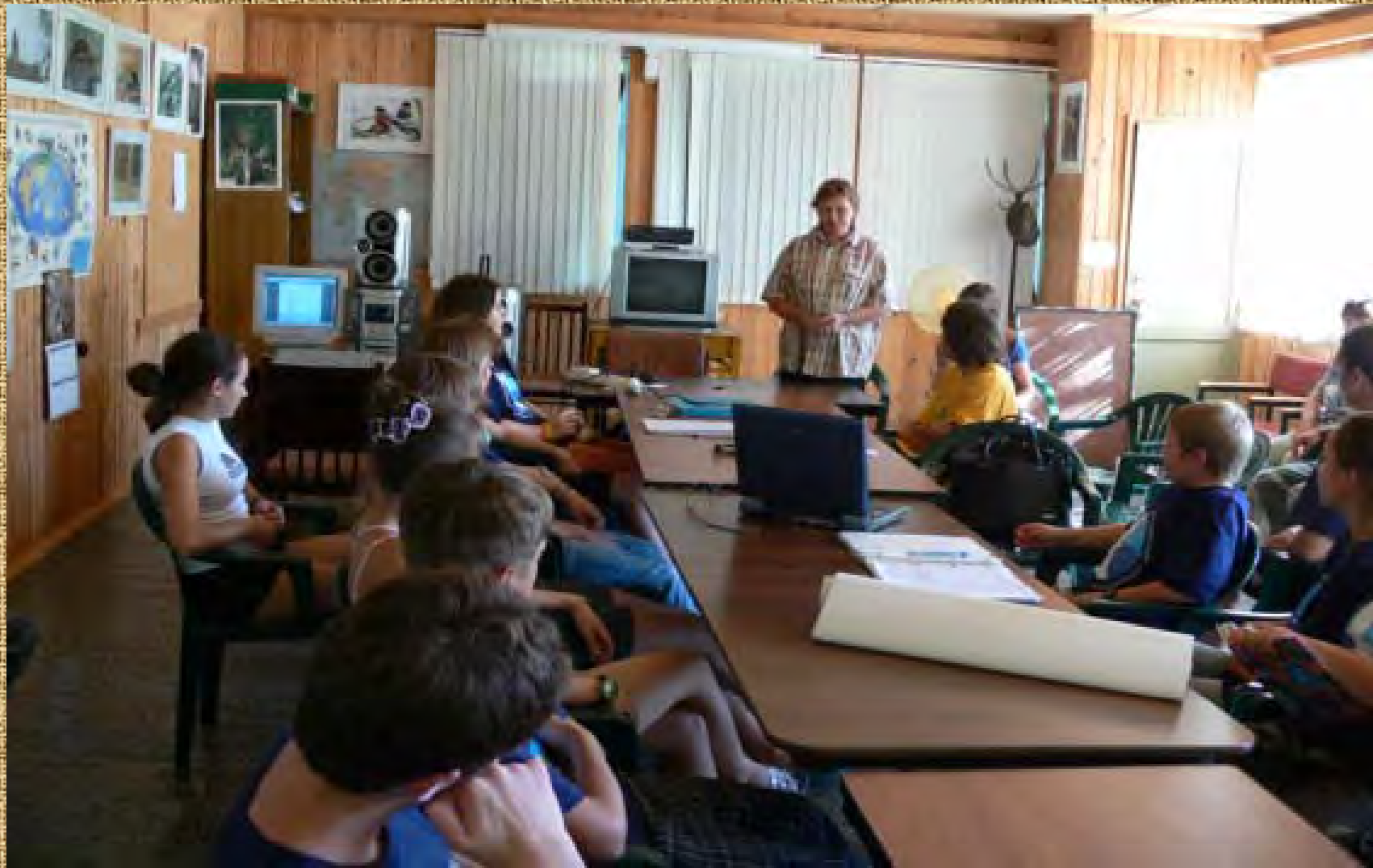
Participants of the school ecological expedition in the Centre for Visitors