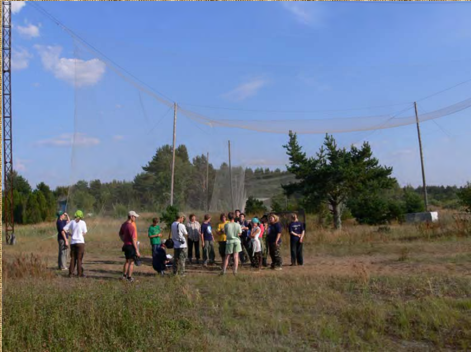
An excursion to the ornithological station.