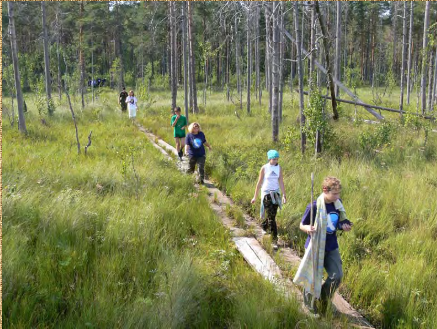
Walkways through the Ladoga belt marshes