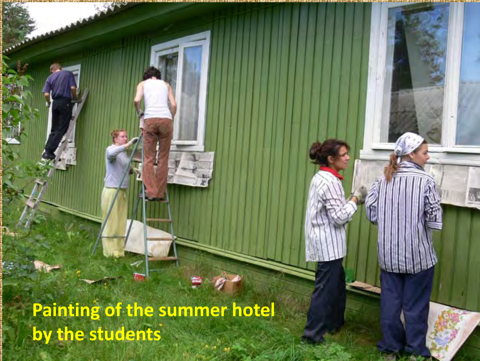
Painting of the summer hotel by the students

Almost all of our guests provide the reserve a feasible help beyond their main purpose.