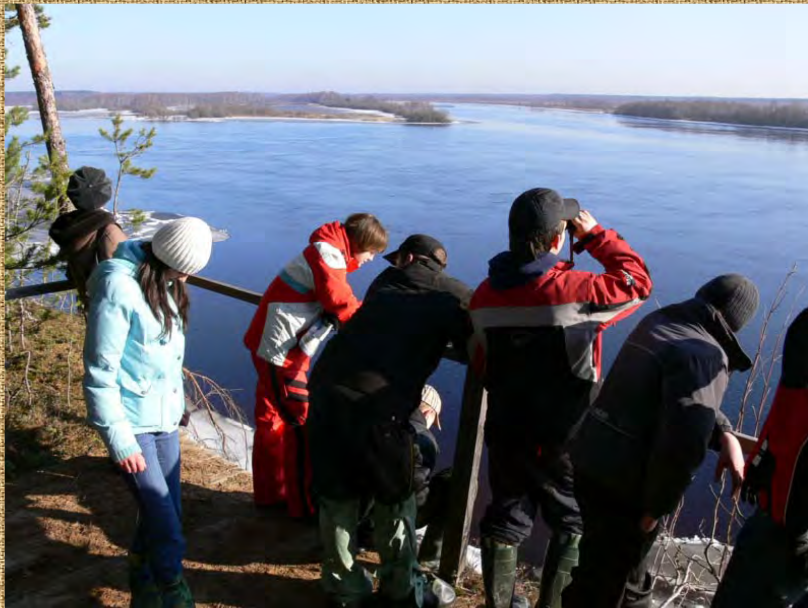
Viewing platform on a steep bank of the river Svir.