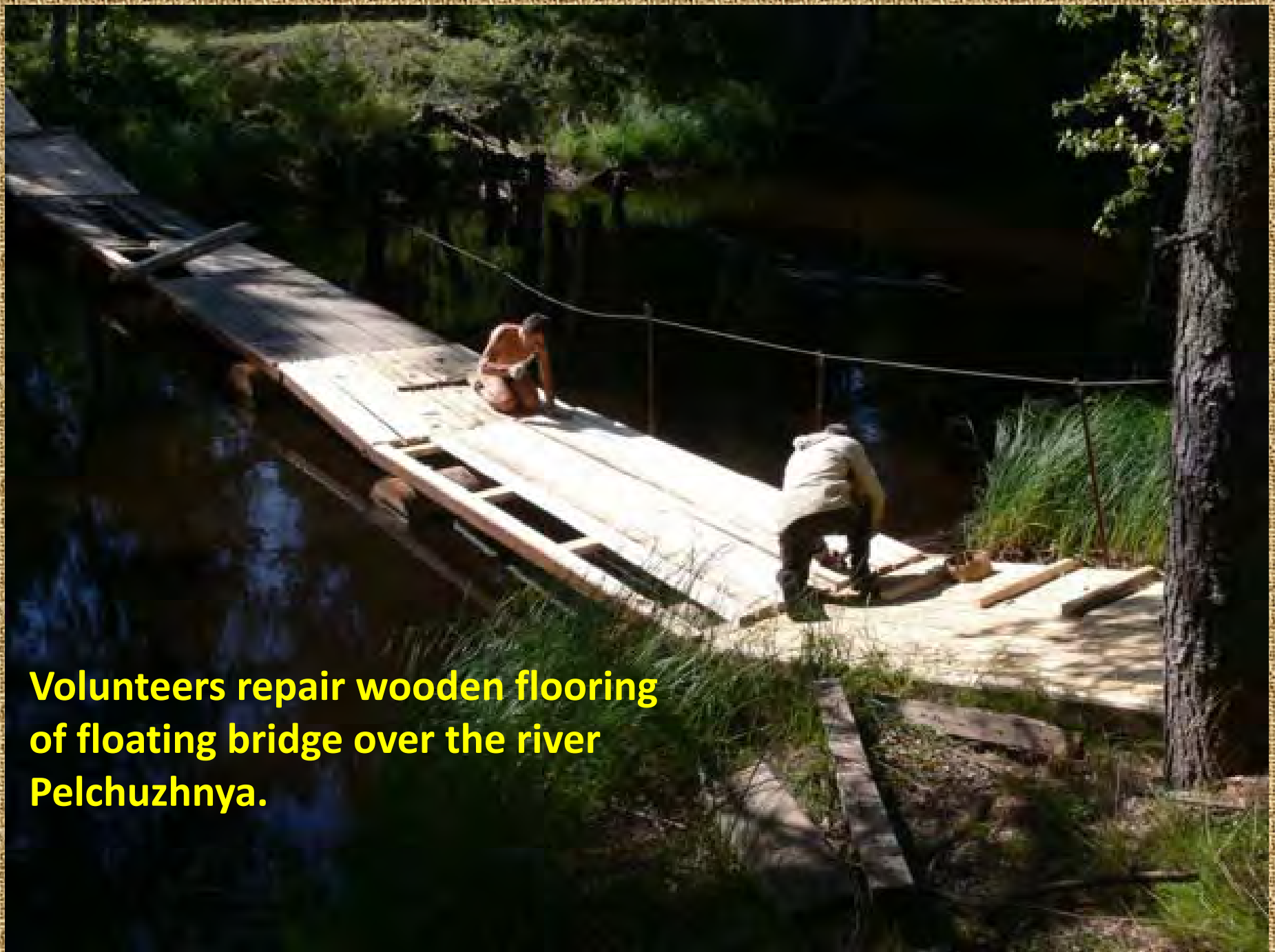
Volunteers repair wooden flooring of floating bridge over the river Pelchuzhnya.