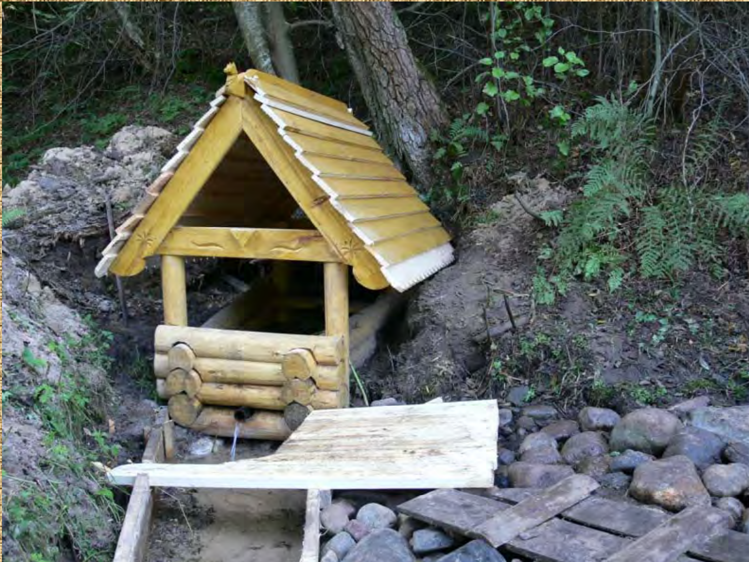
A spring, designed by volunteers