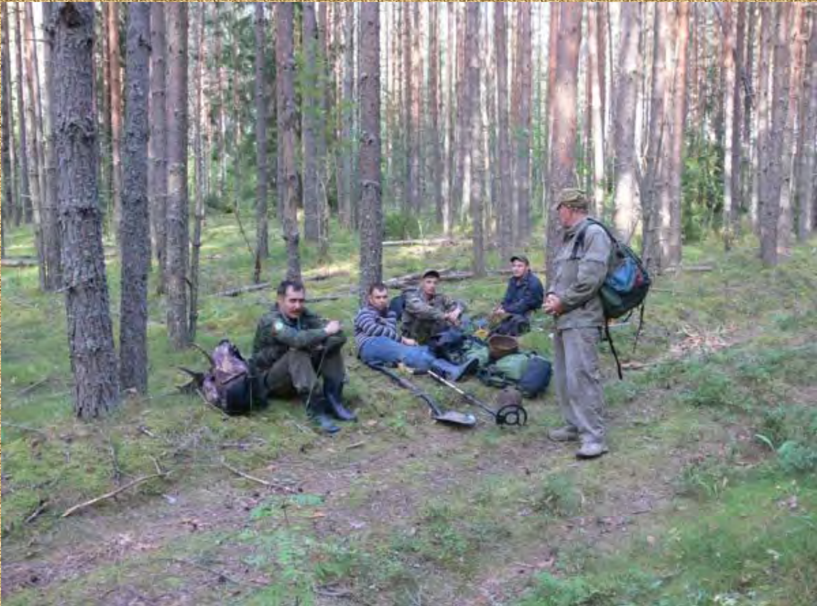
Members of the search group "Svirsky line" are on a halt.