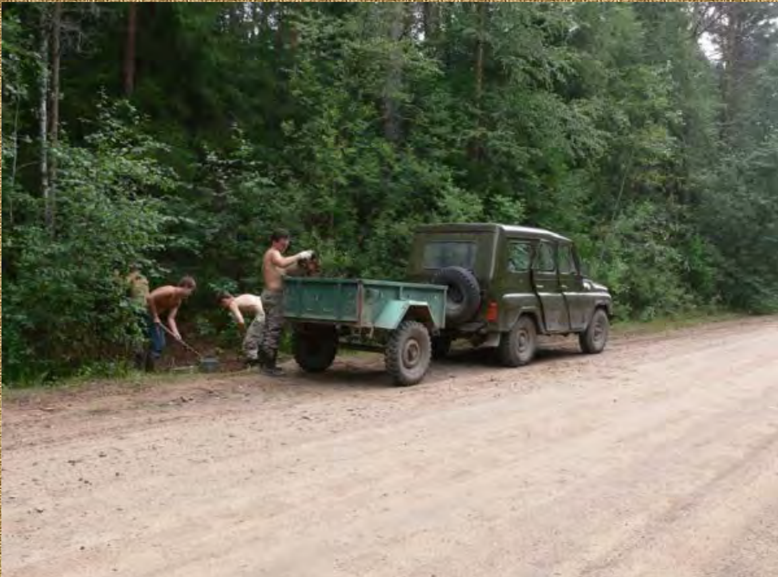
Students from Moscow pick up stones and sand to repair workshops and design spring.