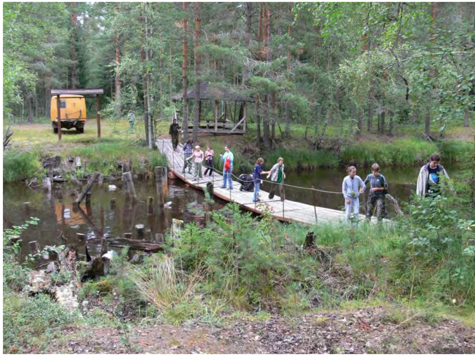
Through a forest stream