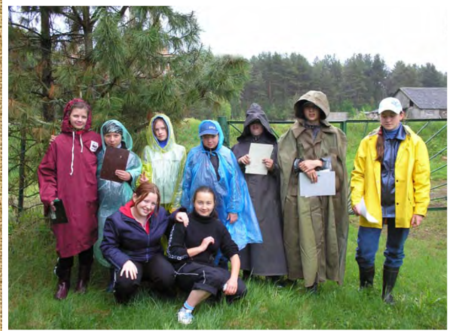
Students of the ecological circle into the practice