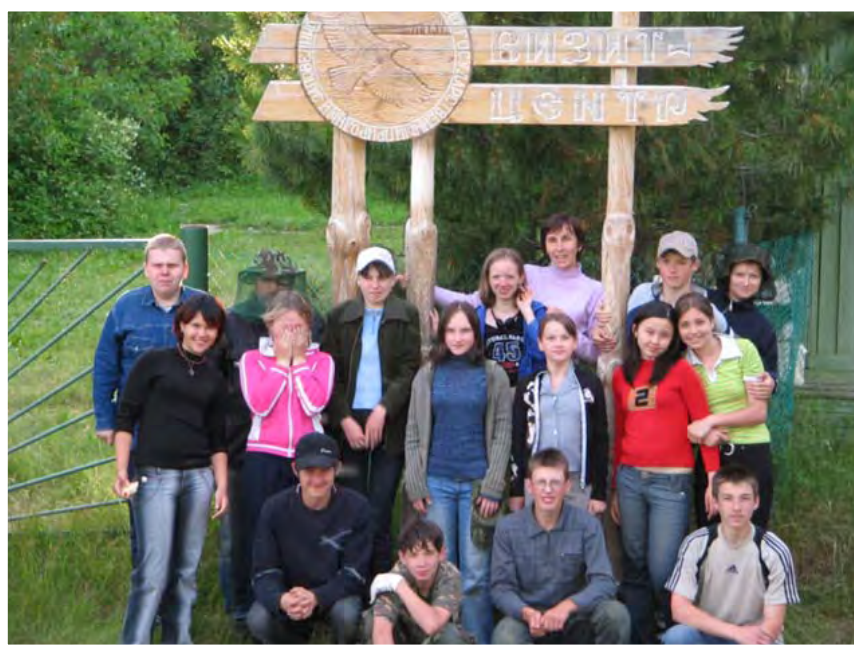
Ecological Expedition of school № 3 (Lodeynoe Pole)

30-35 organized groups (2-3 of them foreign) per year visit the reserve. These are 250-340 people. Among them are students, biologists, members of social organizations, children's environmental camps, nature lovers and travelers.