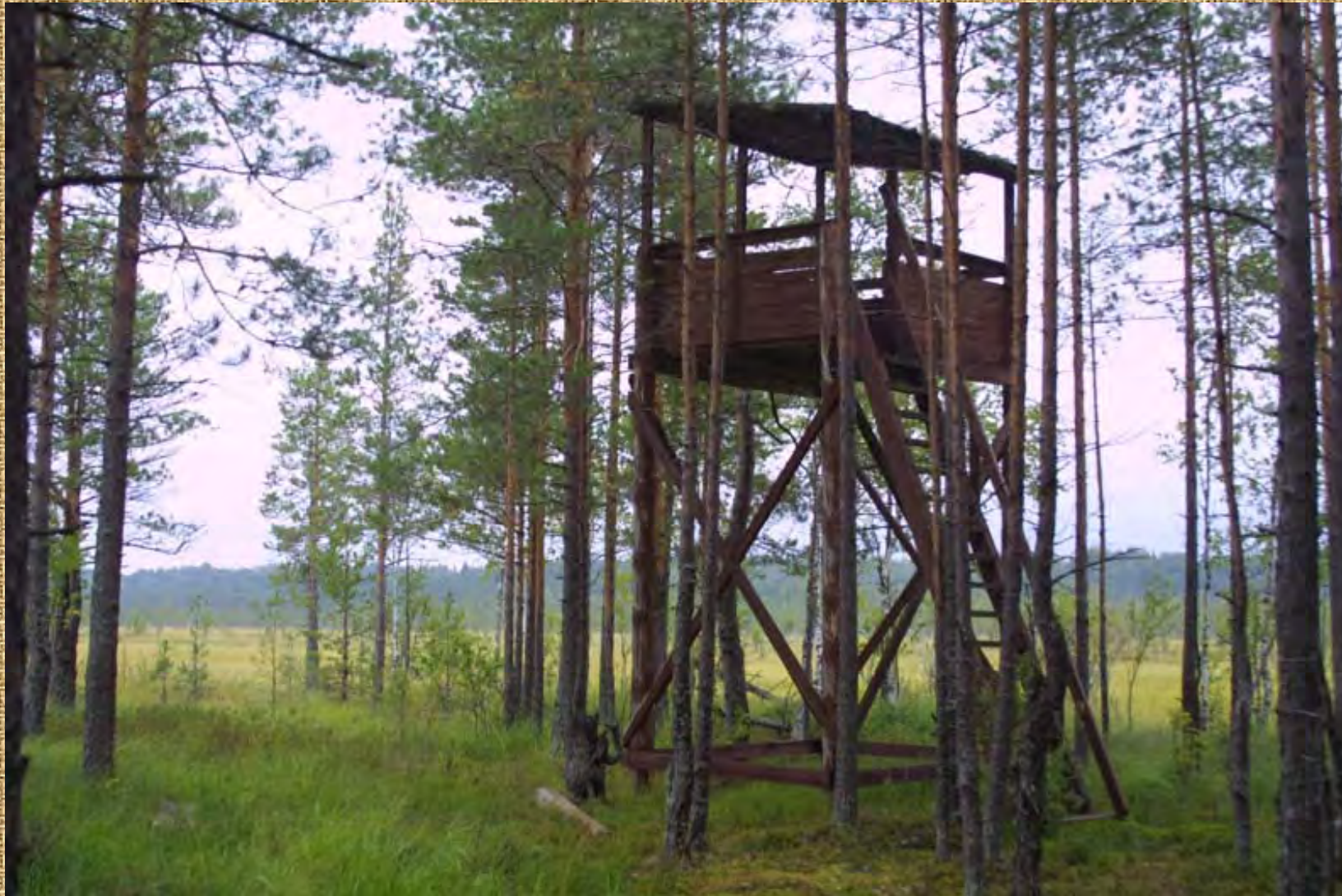
The observation tower at the edge of a raised bog