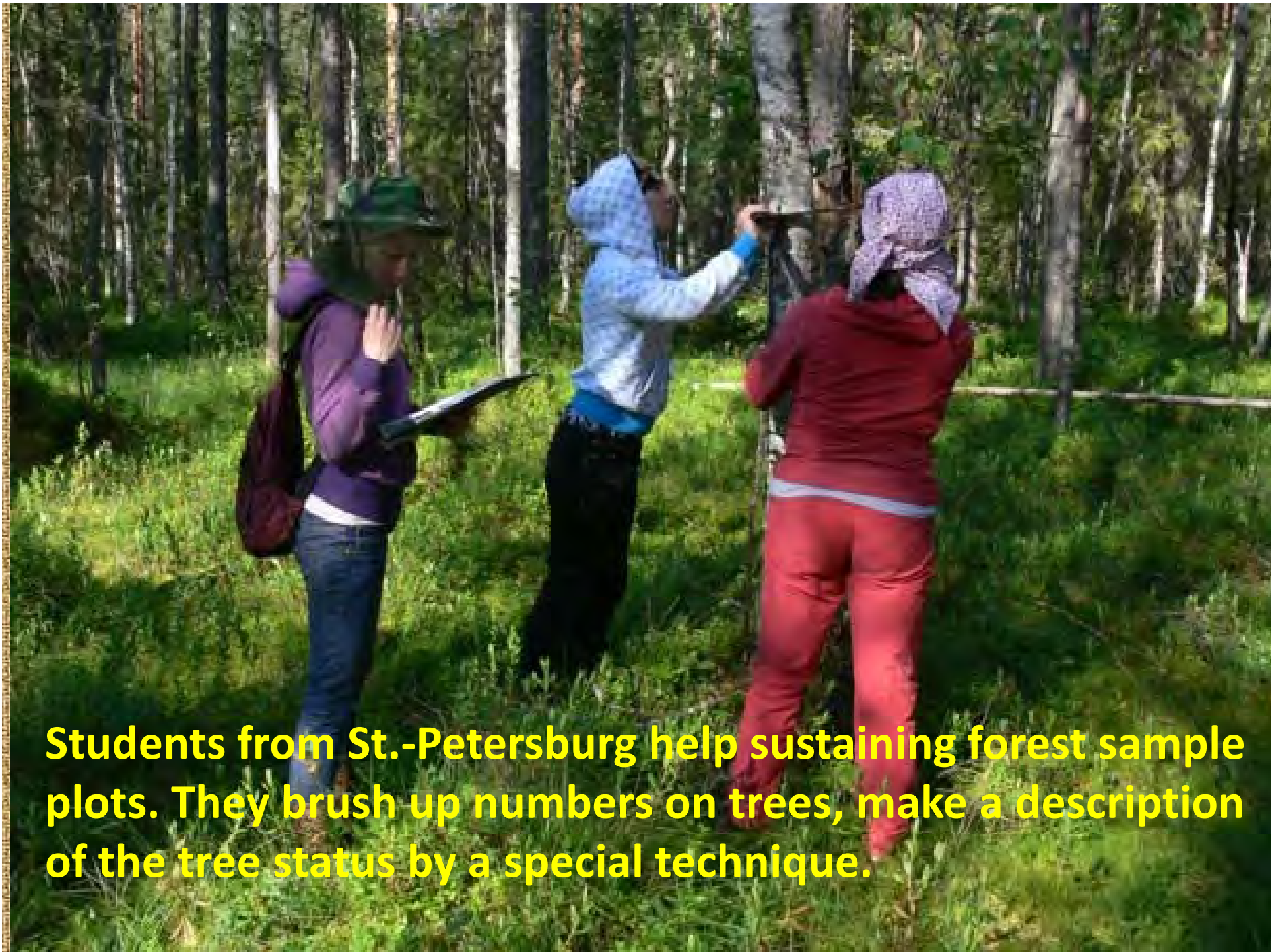
Students from St.-Petersburg help sustaining forest sample plots. They brush up numbers on trees, make a description of the tree status by a special technique.