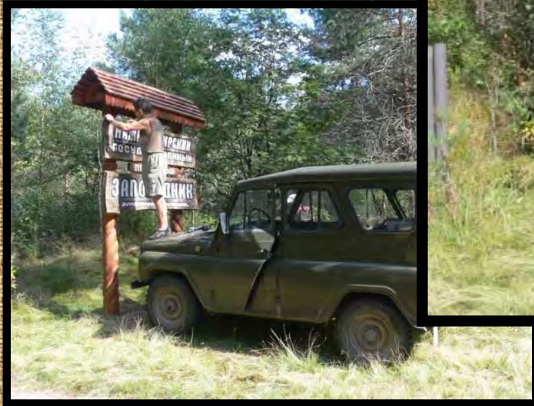
Making a carved banner