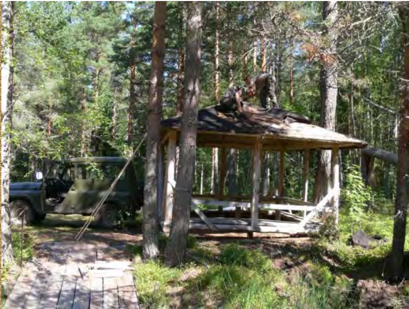
Members of the search group are repairing roof of a gazebo on an ecological path