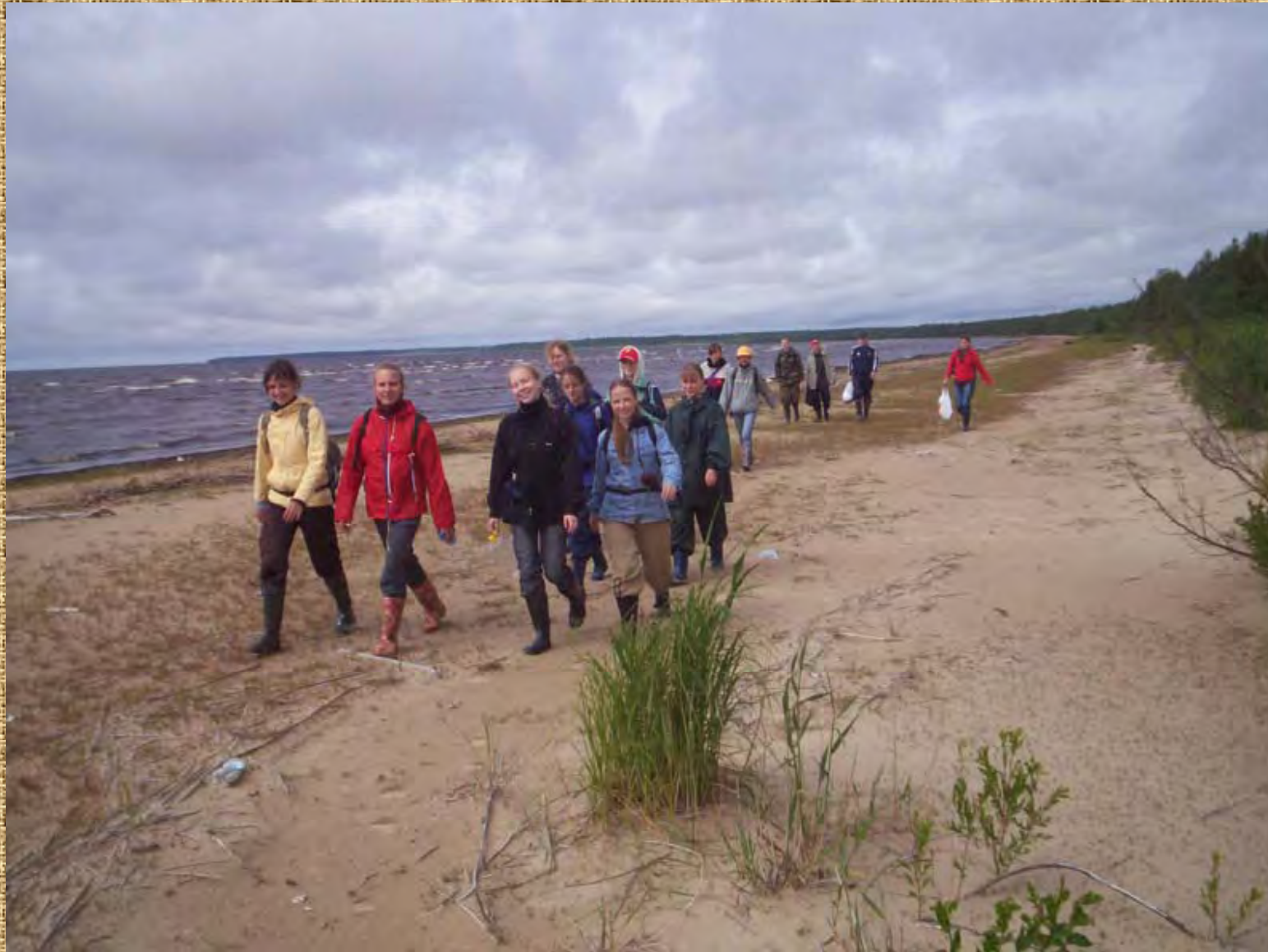
On the shore of the Lake Ladoga.