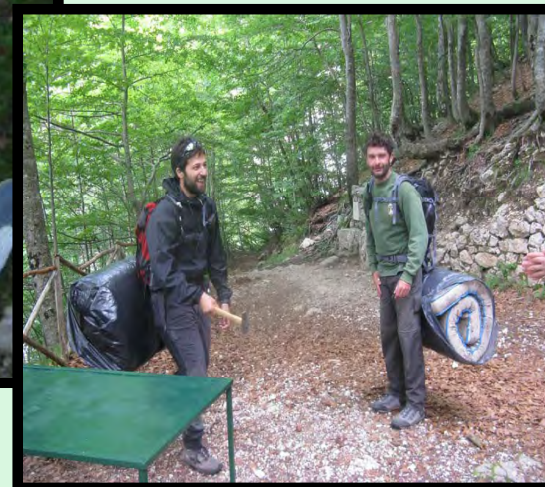
Will to do